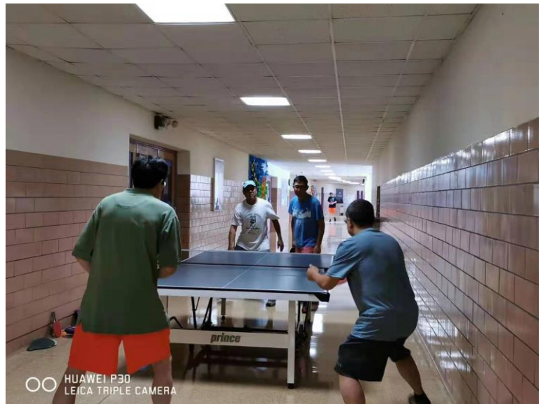
Due to safety concerns and limited space, playing ping-pong in the hallways or the gymnasium on Saturdays is not allowed.