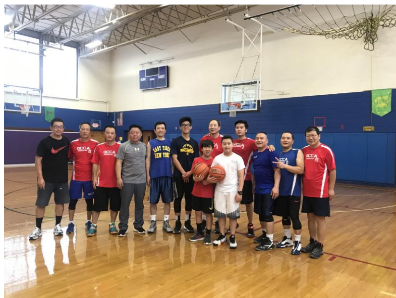
Sunday Morning Sports at OCCS: OCCA youth and families spend their Sunday mornings playing a variety of sports together in the school gymnasium. Picture taken on Sunday, September 29, 2019. More sports photos on page 4.