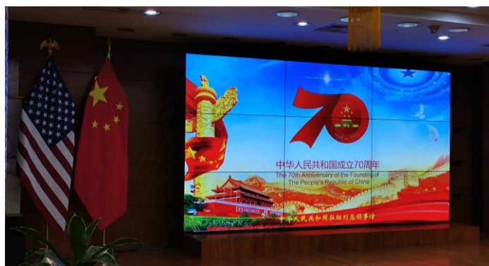
On Thursday, September 19, 2019, OCCA members attended a reception held by the Chinese embassy in New York City to celebrate the 70 th anniversary of the founding of the People's Republic of China (full article on page 7).